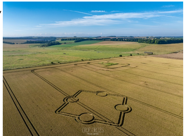
FROM LORD RAMA: LATEST CROP CIRCLE

“Meanwhile, in the higher realms, there was an X Class 1.27 flare yesterday. This is amplifying all the chaos on earth. Our orders are to you, sir: go out and do some Tai Chi and some Kung Fu, and use the Force to lift the energies higher! See you in the Light of the Most Radiant One! Sat Nam! Namaste! Blaze the Violet Fire!”