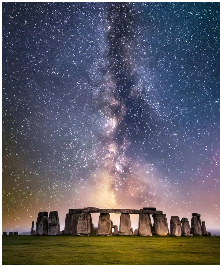
The Milky Way Galaxy, home of the Hunab Ku, intersecting with Stonehenge, one of the primal spiritual centers on the planet.

"Yet this story originates up the pecking order to the Vatican because the fallen angels are going to make some kind of event that will show up in our skies – ie, a fake alien invasion which will fail. It is as Lord Kryon has said last week: The Light is Winning! There are monumental events unfolding each day, such as a very large coronal hole in the sun today, and there are even more star ships coming through portals in our sun, Sol. We are living in exciting times! Sat Nam! Namaste! Blaze the Violet Fire! Om Shiva! "