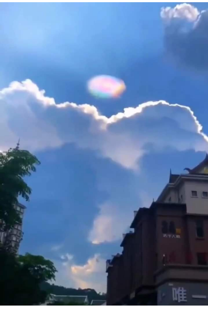
From Lord Rama: A Rainbow Plasma Ship over China today