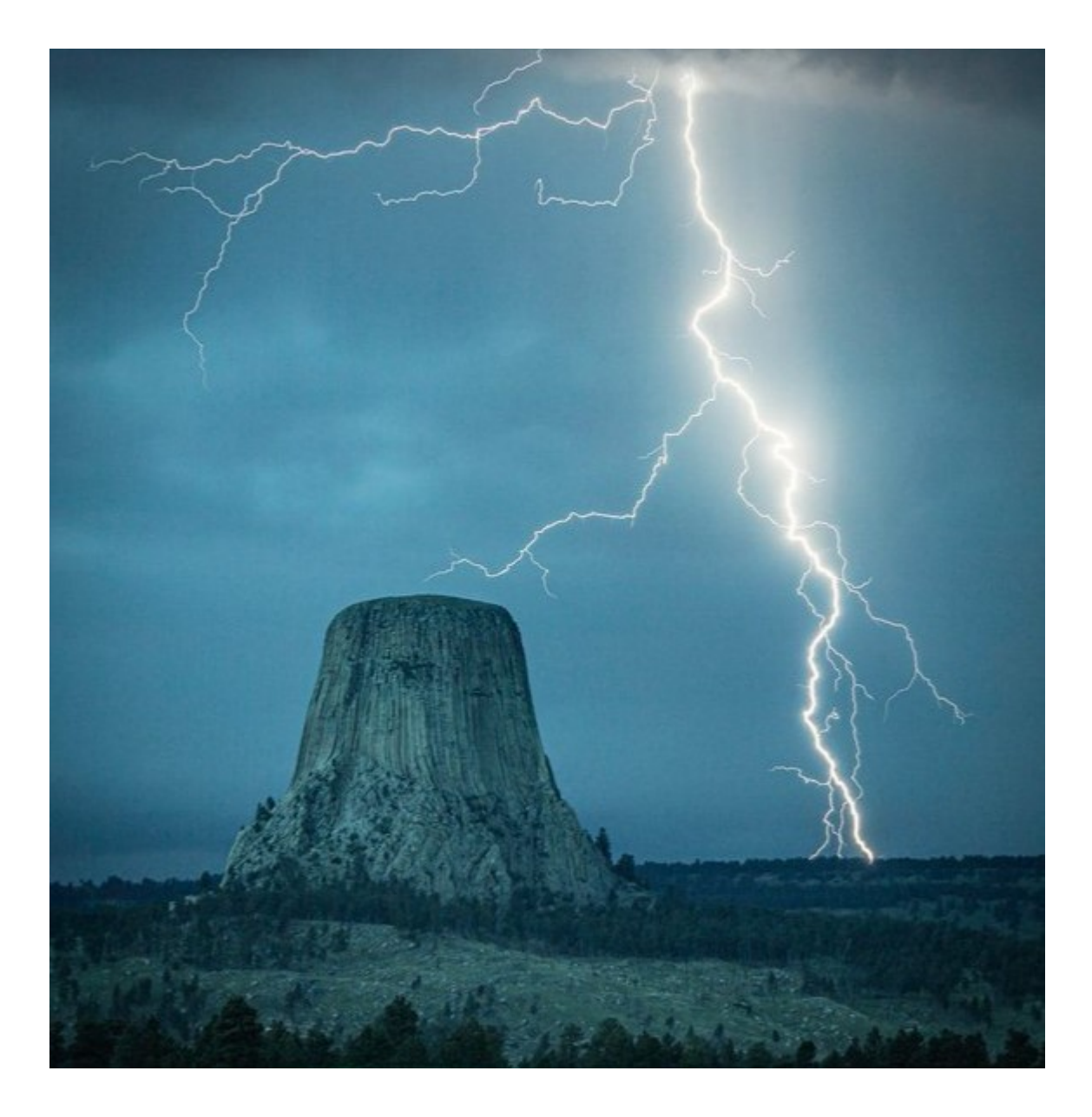
FROM LORD RAMA, thanks to Tom and Company: the space ship is just visible in the clouds over the top of The Devil's Tower; it's framed by the two long fingers of lightening!

"Meanwhile the big solar flares continue. Spring is really coming in like a lion in some places and, in other places, it is still winter. In terms of the big story, it is just another day in the matrix. Blaze the Violet Fire! See you in the Light of the Most Radiant One! Sat Nam! Namaste!"