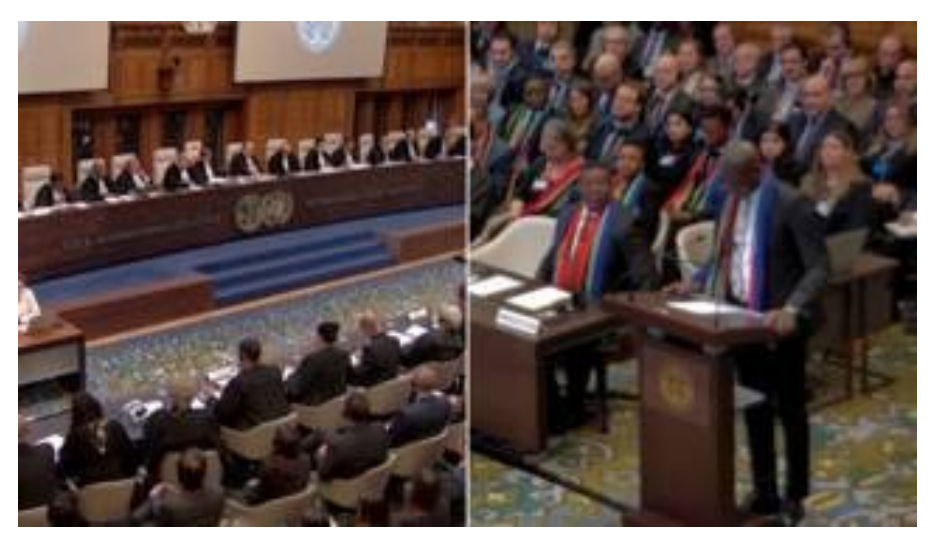
SEE THE TRANSCRIPT AT THE END OF THE NOTES . . .

https://www.democracynow.org/2024/1/11/south_africa_genocide_case_israel_gaza